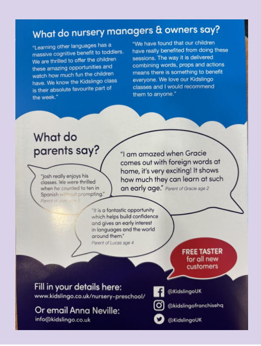
Have a lovely weekend!