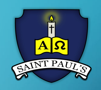
"Let all that you do be done in love"