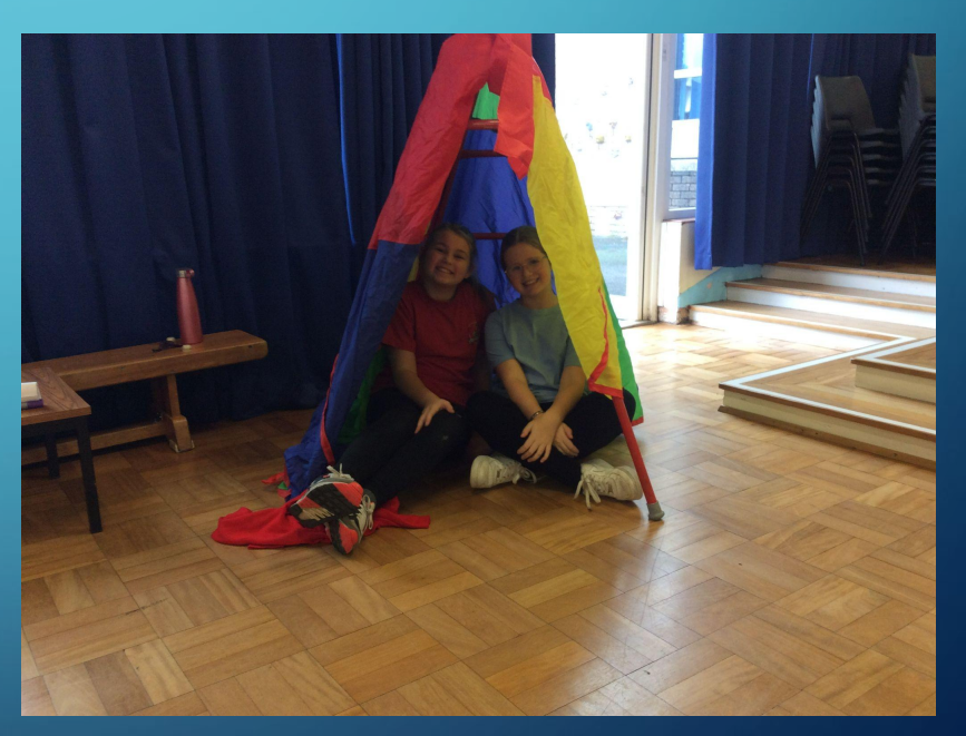
Let all that you do be done in love'